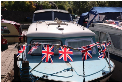
Cruiser Free Spirit