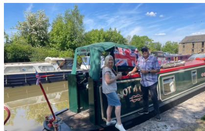
NB Knot a Clue