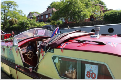
Cruiser Fleur Denise