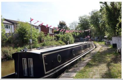
NB Meandering On