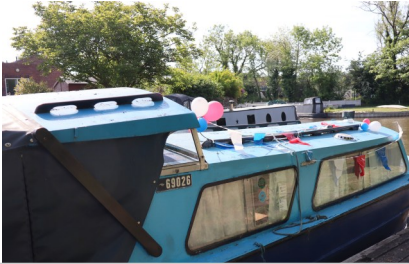
Cruiser Lazy Days

Who do you think had the best dressed boat? I would not have liked to be in the Commodore's shoes. What a hard decision he had.