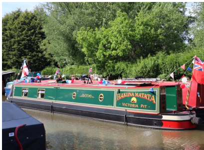
NB Hakuna Matata