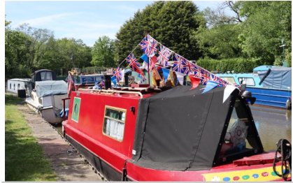
NB Gowker Lily