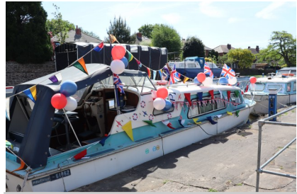
Cruiser Shropshire Lass