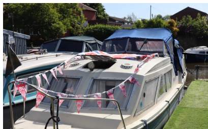
Cruiser Zig Zag