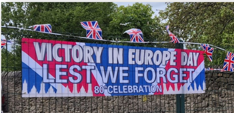
Front Page Image

In the United Kingdom, it has often been called VE Day. The term started as early as September 1944 in anticipation of the impending victory.