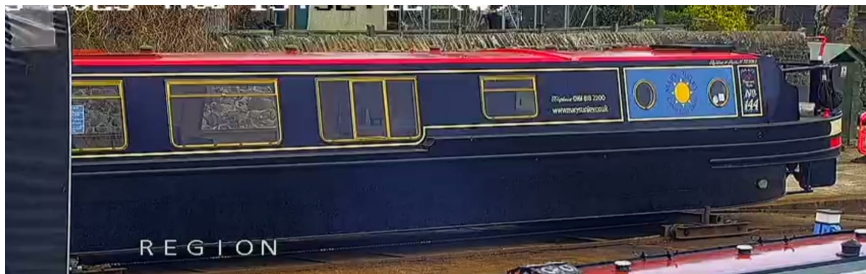
The Mary Sunley - Disability Boat taking the first booking of the year