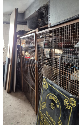
Workshop clean up