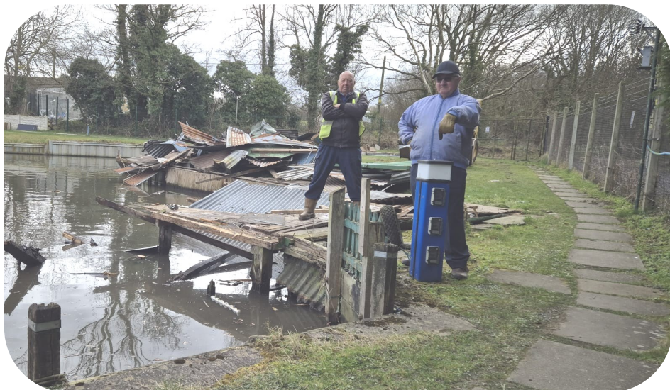
The Demolition Team (Mike's taking the pic)