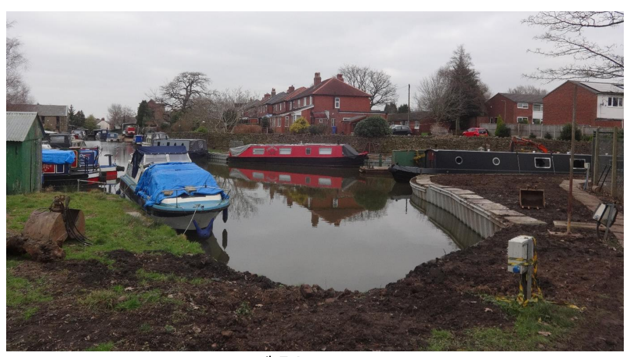
12<sup>th</sup> February 2023