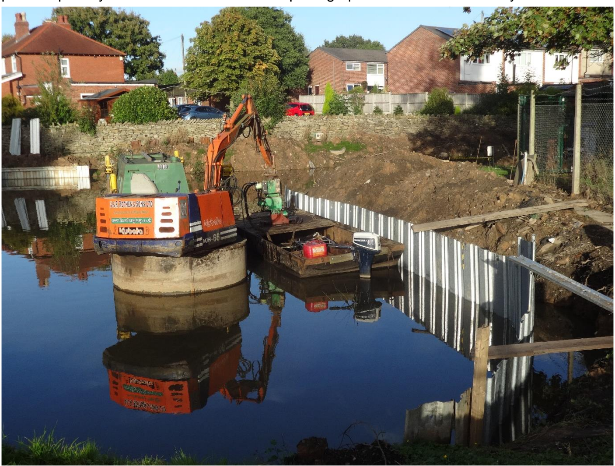
8<sup>th</sup> October 2022

Our hardy piling/dredging/boathouse dismantling team have made much progress during the past couple of years. The 'before and after' photographs below bear testimony to their work.