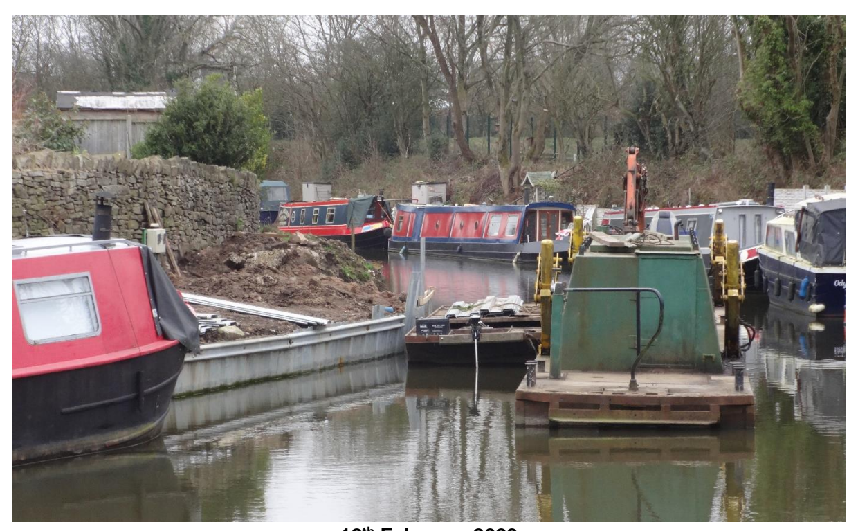
12<sup>th</sup> February 2023