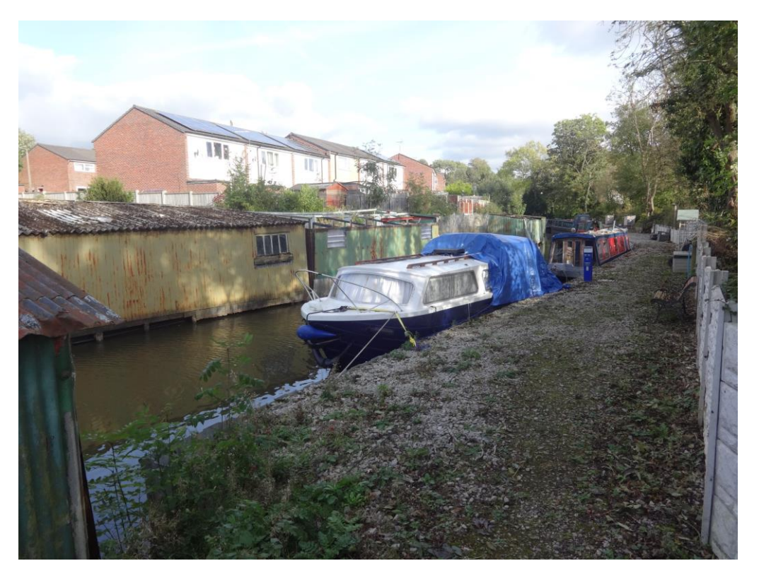
Looking Towards the NCCC Club Arm Entrance 10th October 2021.