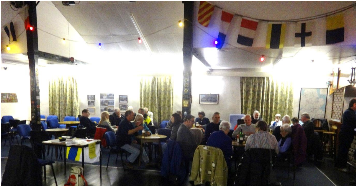
New Members Evening Friday 17th February 2023

A big 'Thank You' to all who made this event possible