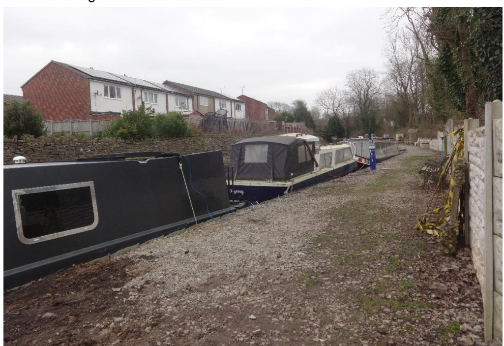
The same view sixteen months later, on 12<sup>th</sup> February 2023.

A big THANK YOU to all who made this transformation possible! See also Pages 3, 4 & 5.